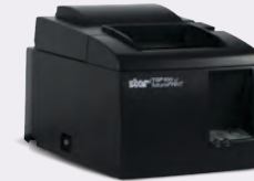
Star TSP100 Printer