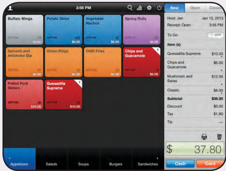
Example of the POS interface on the iPad.

The BCMS Point-Of-Sale (POS) system, in partnership with Talech, is state-of-the-art technology designed to help you run your business efficiently. Our POS has a simple and intuitive interface which allows you to take orders, manage your inventory, access customer information, and view daily reports.